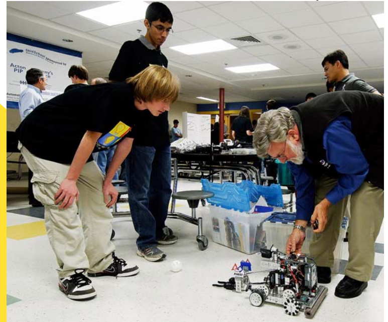
AB Robotics at Discover STEM 2010-2011 Sponsors: AB PIP, Raytheon and Solidworks