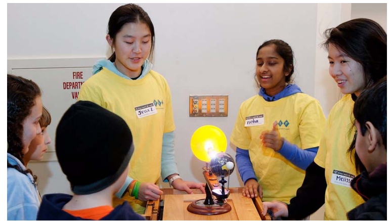
Star Party Volunteers

Acton Nature & Wildlife Guide. Sponsored by AB Schools, Town of Acton & PIP. Guides are available through PIP as a fundraiser. Details at actonpip.org .