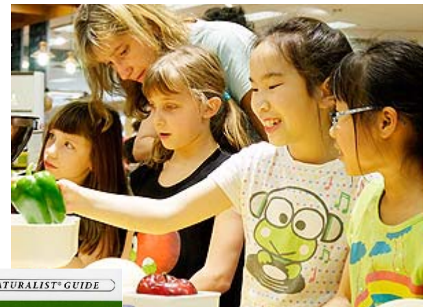
Market Math at Roche Bros.

Acton Naturally, Guide to Local Species . Sponsored by AB Schools, Town of Acton & AB PIP STEM. Guides are available for $6 from AB PIP STEM or at EMS in Acton. Details at actonpip.org .